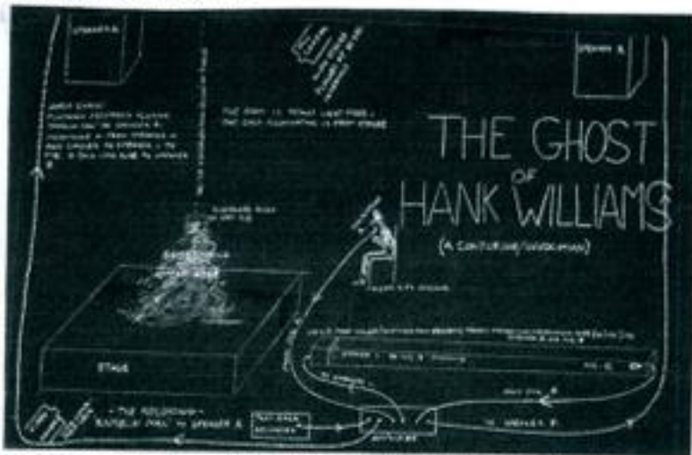
David Askevold: The Ghost of Hank Williams, 1979-80 , white chalk on black posterboard, 29 1/2 by 37 1/2 inches.