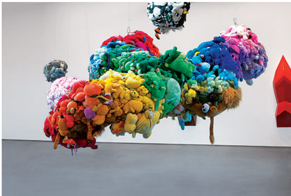
Mike Kelley's 'Deodorized Central Mass With Satellites' (1991–99).