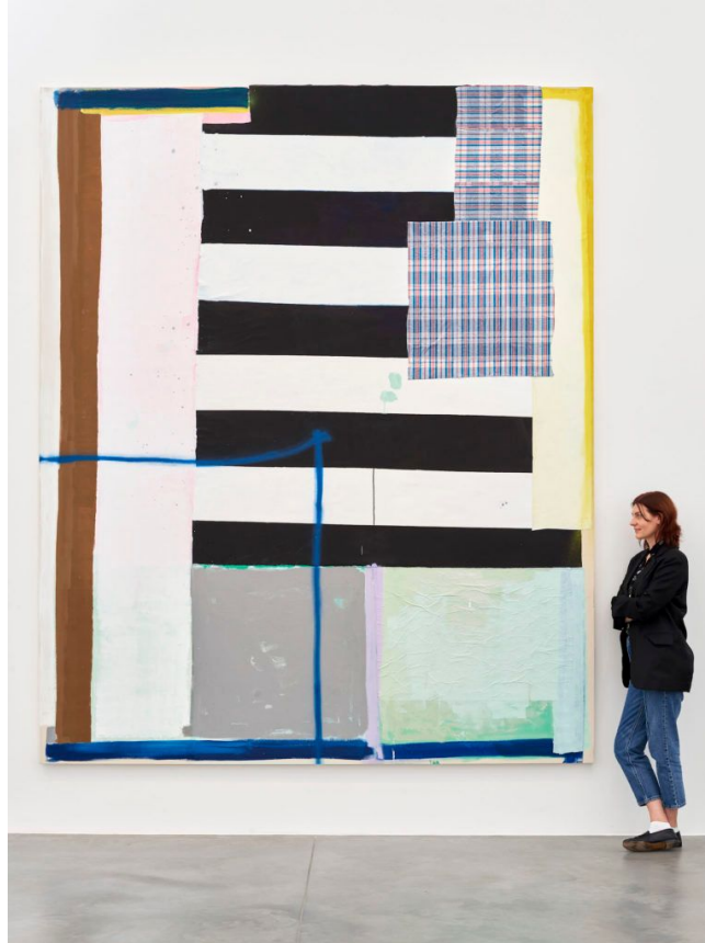
Sadie Laska with one of her paintings in the "True Colours" exhibition at Damien Hirst's Newport Street Gallery.

"I've wanted to work bigger for ages but there are challenges with working at that scale. Lots of those challenges are practical ones and you need a certain level of infrastructure to make it possible," Saville told The Art Newspaper . "Damien has been an amazingly kind mentor."