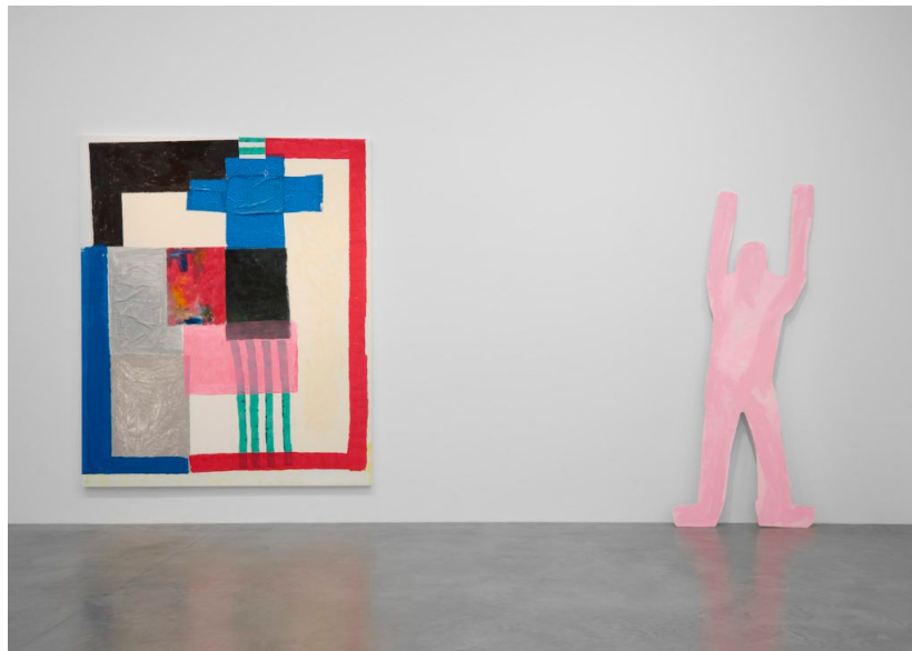
Installation view of the "True Colours" exhibition at Damien Hirst's Newport Street Gallery.

"True Colours: Helen Beard/Sadie Laska/Boo Saville" is on view at the Newport Street Gallery , Newport Street, London, SE11 8AJ, June 6–September 9, 2018.