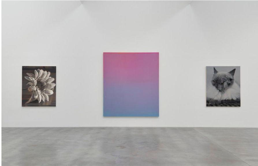
Installation view of the "True Colours" exhibition at Damien Hirst's Newport Street Gallery.