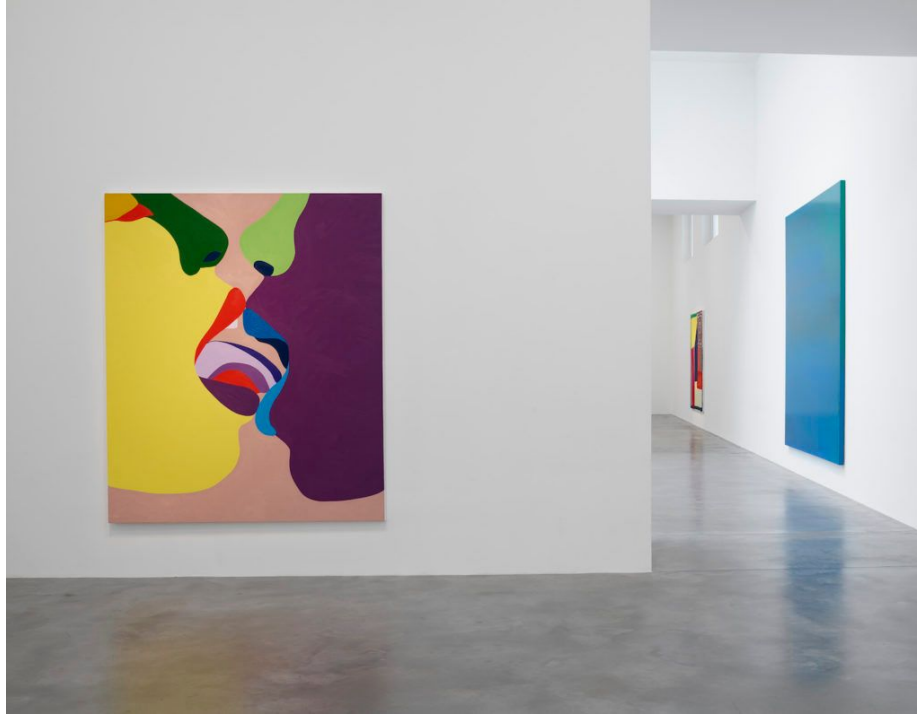
Installation view of the "True Colours" exhibition at Damien Hirst's Newport Street Gallery.