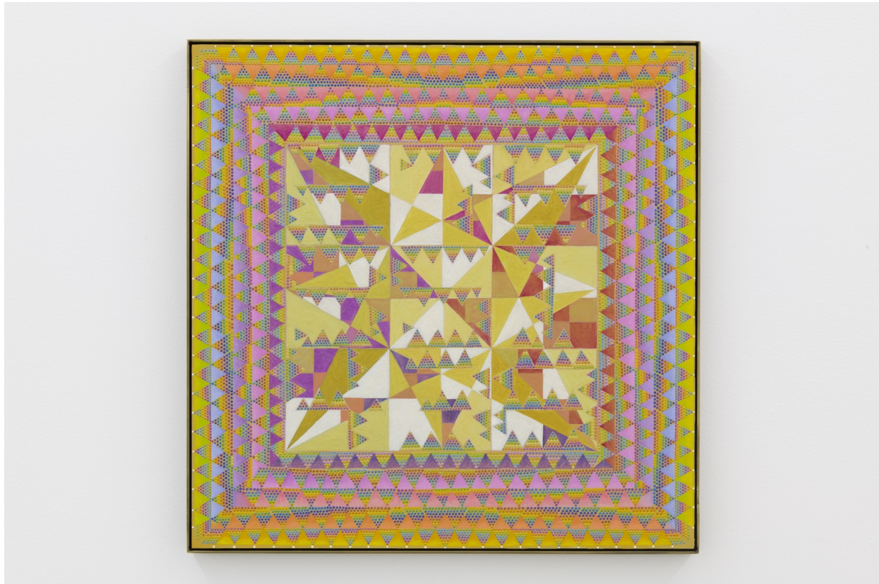
Xylor Jane, “Magic Square for Earthlings,” 2017. Oil and ink on board, 19.75 by 19.75 inches Parrasch Heijnen Gallery

Her third solo show in Los Angeles, “Magic Square for Earthlings,” is a tour de force of delicacy and nuance, its devotion and generosity putting visitors in touch with otherwise invisible patterns and rhythms that structure the cosmos while making us see that we are part of the mystery.