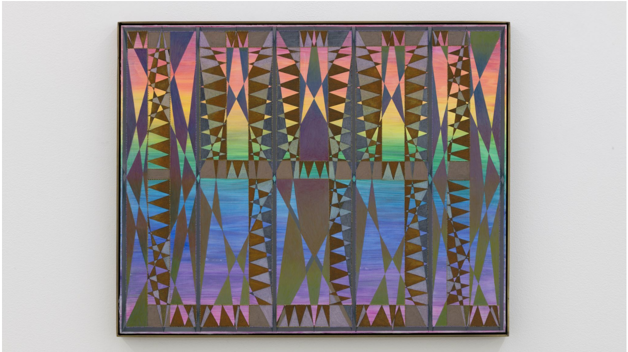
Xylor Jane, "91418," 2017. Oil on board, 16 inches by 20 inches. Parrasch Heijnen Gallery