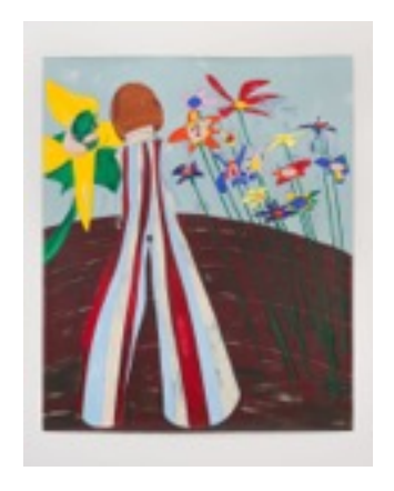
"In The Garden" (2014) by Nicola Tyson. Acrylic on linen, mounted in frame. 85 x 72 inches. Courtesy of the artist and Susan Vielmetter Los Angeles Projects.

Cameron employed up-to-the-minute technology — a cellphone — in coming up with the photographic images in his intriguingly ethereal "Clouds" series. The Berlin-based photographer is also a contributor to, and curator of, "The Poster Project presents." Positioned across the lobby from