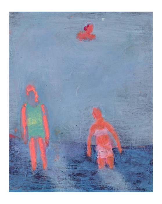
Upright Swimmers with Mother, 2016, acrylic on canvas.