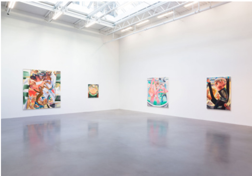
Dana Schutz's current show at Petzel.

I think that the fracturing Cubo-Futurist construction and structure of these works, the ways she's crossing the glittery temporal and planar shifts of Boccioni with Peter Saul's insane, all-over narratives in blazing acrid color, is an artist undertaking a remarkable painterly feat. There is a lot going on in every one of these works. However, except for a couple of canvases, I'm not sure that there's any one thing going on. This is a problem. (I would kill for any one of her drawings, however.) We are in awe of Schutz's immense skill at mustering frontal energy and painterly verve. Yet, as active as everything is, too many times I felt like I was mainly looking at parts. Never a whole. Too often the work tightened into something like a New Yorker cover illustration. I remember a great 2004 work of hers, another allegory of painting, a huge horizontal figure being dissected by doctor types amid a large number of onlooking heads. The picture was busy, but it was still so iconic that it tattoos itself permanently in the mind as an image. The work here is cartoony, crazy, exuding fabulously unfixed visual pheromones. But taste has changed around Schutz; painting has gotten more abstract. This at the same moment that Schutz's work has gotten more figurative, controlled, illustrative, and defined. Not in a good way. I miss the mushy subterranean rhythms and uncanny all-over abstractness of her work. This makes her current paintings feel somehow more isolated than before.