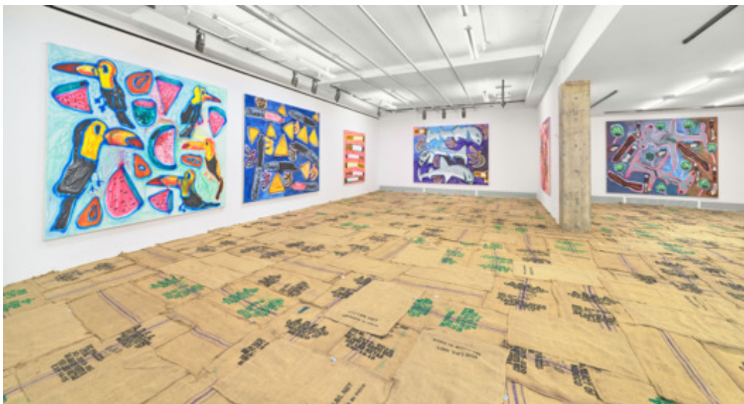
Katherine Bernhardt's current show at Venus Over Manhattan.

Contrary to these sentimental journeys, Schutz and Bernhardt have been endlessly idiosyncratic, always creating wide bandwidth variances of material, scale, surface, touch, tools, technique, color, and figuration. Schutz creates unsteady cornucopia compositions that build out of paint, creating shifting spatial planes that flip-flop, flickering in confetti color and, until recently, with creamy paint, which flower into bucolic clusterfucks. Hers is an everything-but-the-kitchen-sink approach to space. Bernhardt is much looser, her color more electric and intense, bordering on tropical fish that pool in psychedelic lagoons, thinning out, then building up in gluts that turn into brambly palimpsests and clammy reservoirs of iridescence. Her mode of composition is more organized than Schutz's, taxonomical in nature, with everyday images, like toilet paper, fashion models, and shoes, spray-painted, laid out as if found in a pop-culture specimen bed. Forget narrative around Bernhardt; a spitfire magpie, she follows Warhol's credo of "liking things," and paints what she likes the way she likes to paint it. At their worst, her latticeworks break down into wallpaper and place mats; at their best, they become rich visual tidal pools.