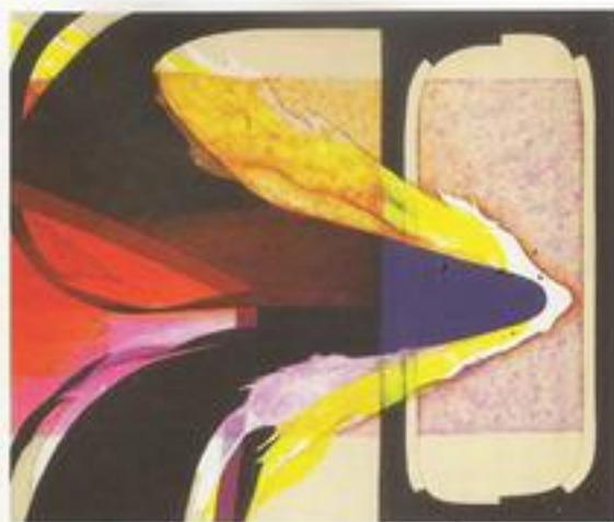
Carrie Moyer, Stroboscopic Painting #1 , 2011, acrylic and glitter on canvas, 60 x 72".