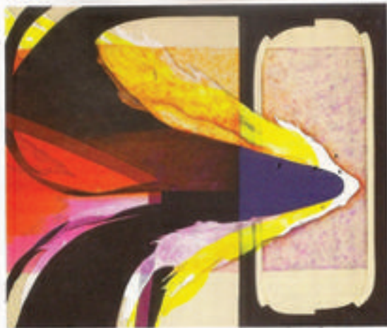
Carrie Moyer, Stroboscopic Painting #1 , 2011, acrylic and glitter on canvas, 60 x 72".