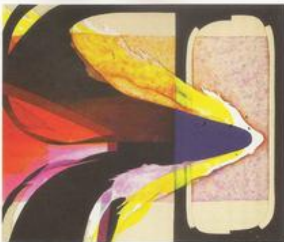
Carrie Moyer, Stroboscopic Painting #1 , 2011. acrylic and glitter on canvas, 60 x 72".